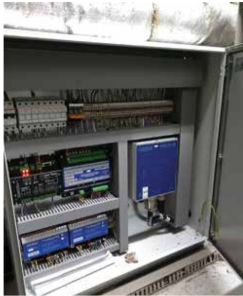
The Motortech open access control panel comes with the IGS-LOG as standard

Operators that can monitor their engine's