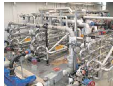
The HRS DTI Series of corrugated tube-in-tube heat exchangers is ideal for sludge applications

Unlike SHEs, the tubes can easily be removed for inspection, cleaning and maintenance and a variety of flange