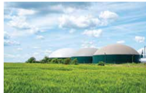
AD operators can improve their engine's performance with real-time CHP monitoring

The ComAp IGS-LOG provides 24/7 emission analysis, enabling an operator to fine-tune their engine. Operating without this vital piece of information is like a chef not tasting their food. It allows the operator to see if their engine is